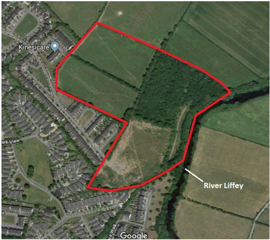
Figure 2 – Site boundary (in red line).

The construction phase will involve the clearance of top soil and sub-soil while treeline and hedgerow boundary features are to be largely retained. Any inert construction and demolition waste will be removed by a licenced contractor and disposed of in accordance with the Waste Management Act.