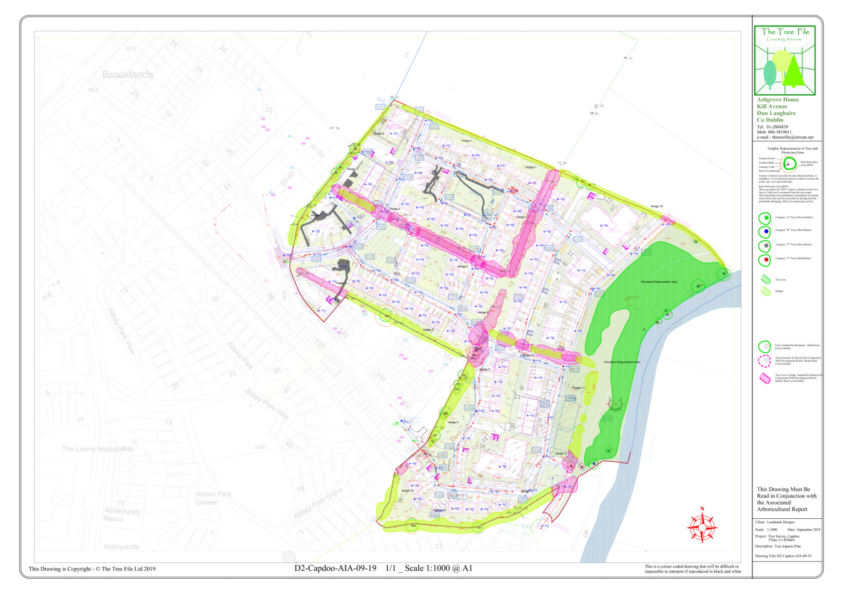
Figure 3 – proposed site layout